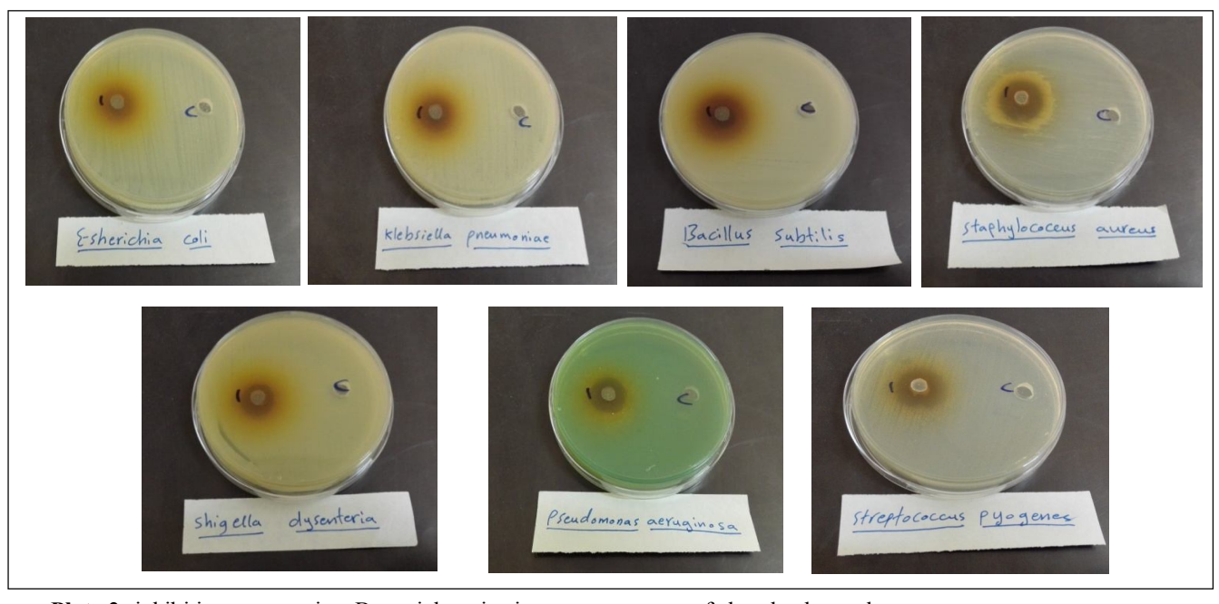
Plate 2: inhibition zone against Bacterial strains in aqueous extract of clerodendrum plant

to examine the bacteria have been seven types of bacteria, a test (Ecoli, pseu., str. p, stap., Basi, shigi., kleb.)